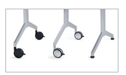
Choose from Black Casters, Two-Tone Casters or Glides