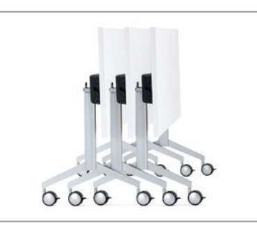
Flip and nest snugly when not in use