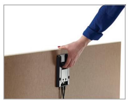
Our easy Flip/Folding Mechanism can be activated with one hand