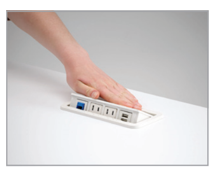
Optional "pop-up" power/data access