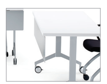
Modesty options available